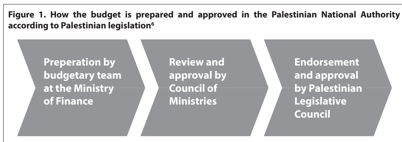
Figure 1. How the budget is prepared and approved in the Palestinian National Authority according to Palestinian legislation 6

in the Ministry of Finance who then send it to the Council of Ministers for review and approval, and then to the PLC for final endorsement and approval. In practice, however due to PLC being inactive, the budget is sent to the Office of the President for endorsement and approval instead of the PLC. 6